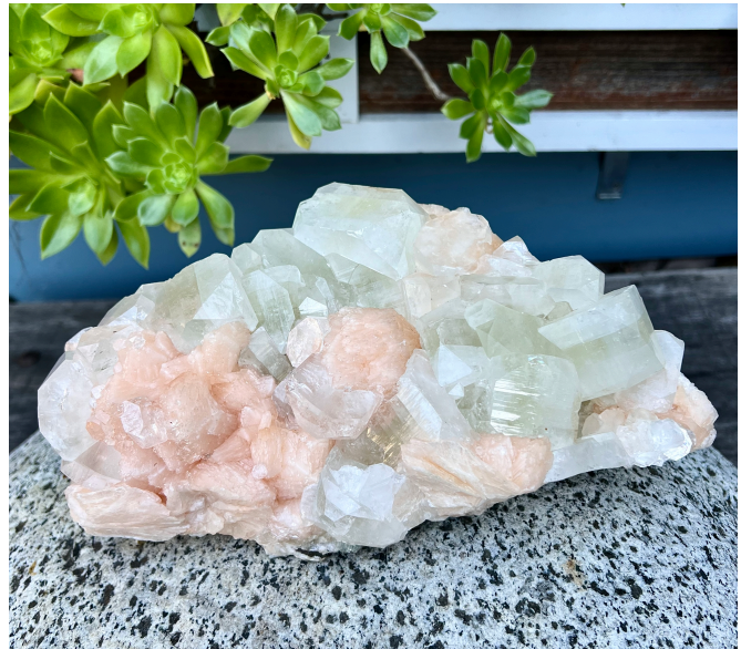
Zeolite Specimen from India

The second piece is a stunning Zeolite Specimen that contains both Apophyllite and Stilbite (pictured on the right). The combination of these two crystals is not only visually pleasing, but also makes for a great energetic duo. Apophyllite is a stone of truth that allows people to recognize their true selves and brings clarity on how to share that inner light with the world. Stilbite is a very gentle and loving crystal. It helps to quiet the mind and soothes insomnia. Together, these crystals create a space of understanding, love, and acceptance. Both have very calming energies that will cleanse, rejuvenate, and uplift anyone that comes near this gorgeous piece.