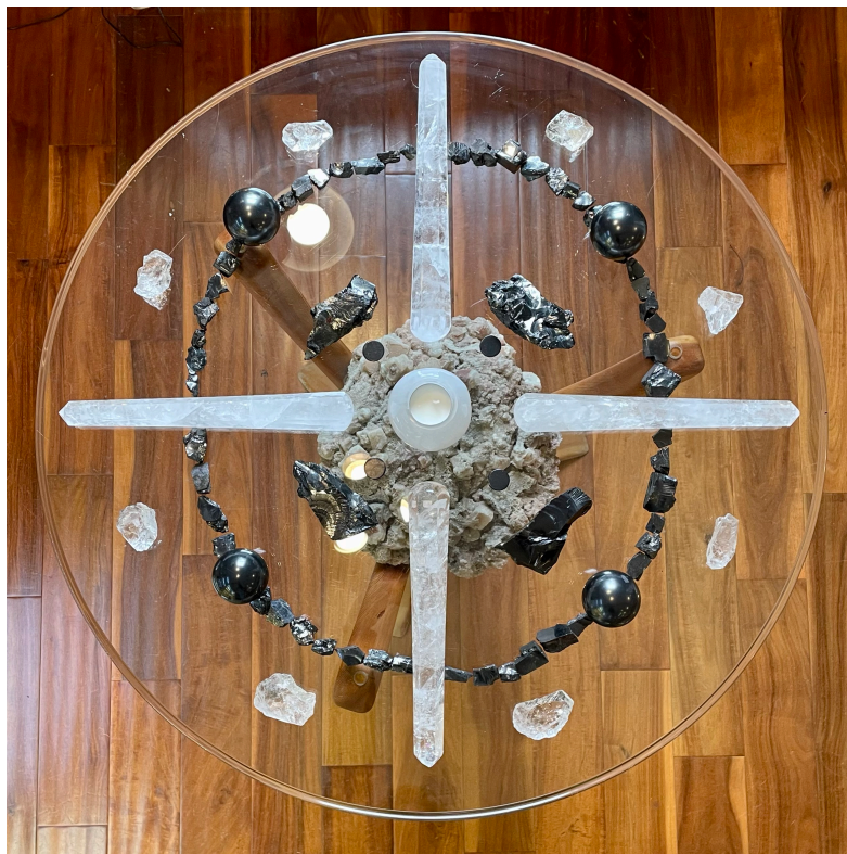
Pictured: Our Crystal Grid for March features Clear Quartz and Shungite, an excellent combination for cleansing and detoxifying.

Luz Elena & the Dynamic Energy Crystals / Big Baby Coffee Team