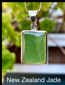
New Zealand Jade