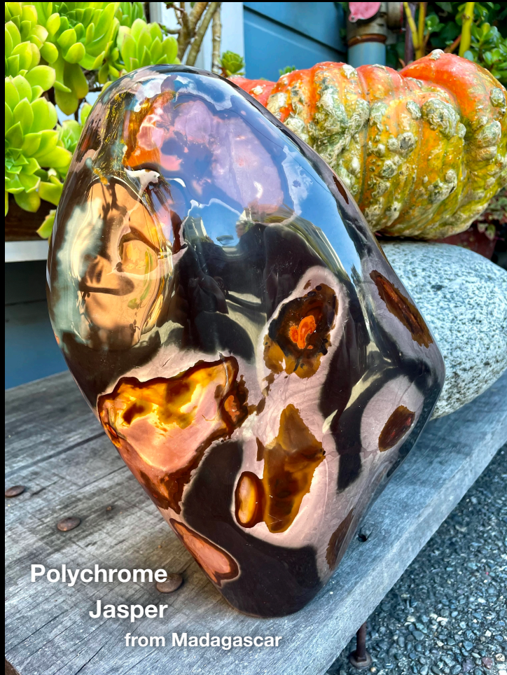
Polychrome Jasper from Madagascar