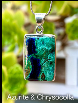
Azurite & Chrysocolla