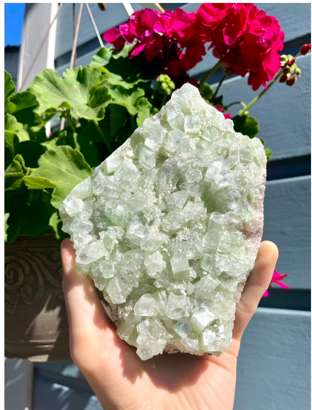
Pictured: Green Apophyllite, a Zeolite Mineral

Zeolites have also made a return to our gallery! Zeolites are named after the Greek words zeo and lithos which translate to "boiling stone." This is because a Swedish mineralogist and chemist named Baron Axel Fredrik Cronstedt discovered that natural zeolites can produce steam when heated up because of their porous nature and high quantity of water molecules. The term zeolite usually refers to a family of crystals & minerals rather than just one. Our new collection of Zeolite minerals comes to us from India and includes Apophyllite, Stilbite, and Heulandite.