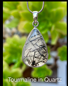
Tourmaline in Quartz